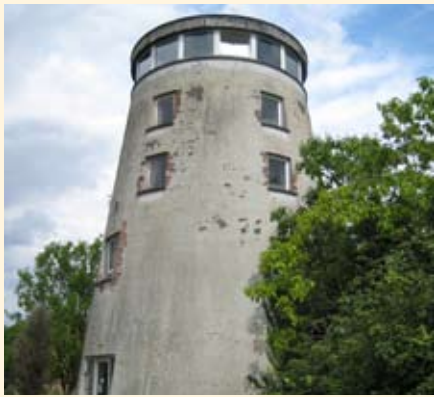
Former Windmill Waveney Road