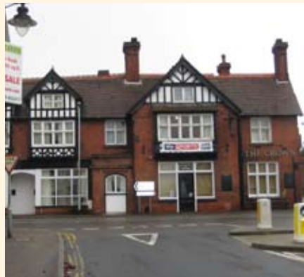
St Nicholas Street