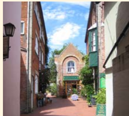
Norfolk House Yard