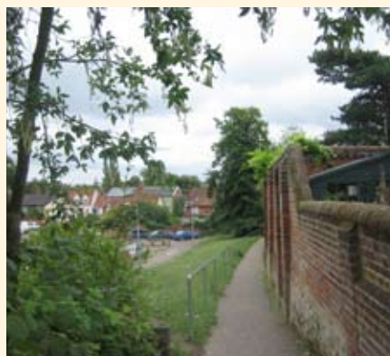
Off Shelfanger Road