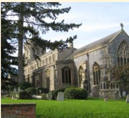
Church of St Mary