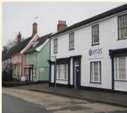
Upper Denmark Street