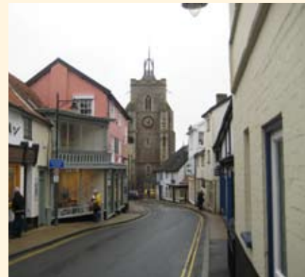
St Nicholas Street