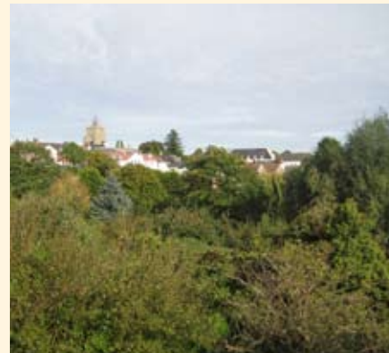
Upper Denmark Street