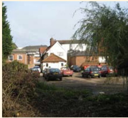
Rear Market Place