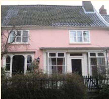
Upper Denmark Street