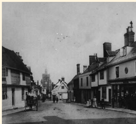
St Nicholas Street