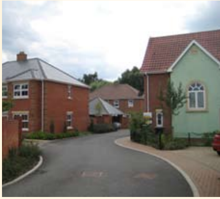
The Old Coaching Place