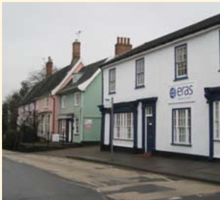
Upper Denmark Street