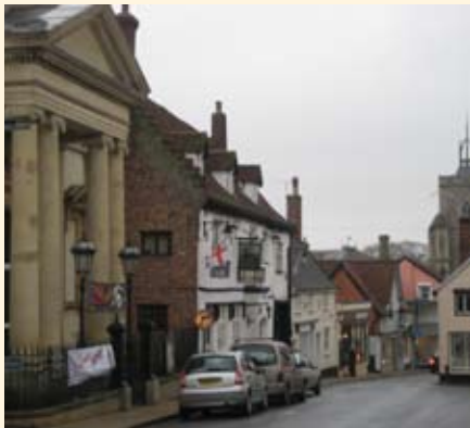
St Nicholas Street