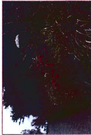
Figure D2: Poringland Settled Plateau Farmland