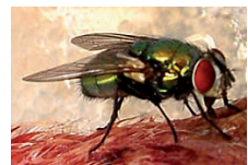
The Blow Fly Calliphora vicina

The House Fly is often associated with rotting/fermenting or moist organic matter and can transmit disease due to their habit of feeding on and contaminating clean material with material picked up from an unclean source.