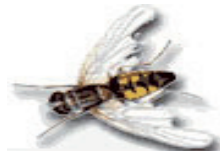
The Lesser House Fly Fannia canicularis